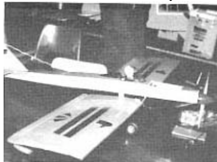
Ken's 1984 AF 40 direct drive Spickler Q500.