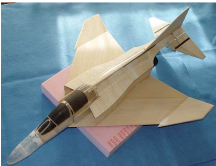
1/20 Scale F-4 Phantom Completed Structure. 9.2 oz.

The plane for this upgraded power system is the New KressJets™ F-4 Phantom.