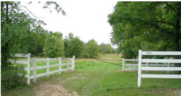
Photo of Entrance to MRCS Site off 7 Mile Rd.

To locate the Midwest R/C Society 7 Mile Rd. flying field , site of the 2010 Mid -America Electric Flies, look near top left corner, where the star marks the spot, near Seven Mile Road and Currie Rd. The field entrance is on the north side of Seven Mile Road about 1.6 Miles west of Currie Rd. Address: 7419 Seven Mile Road, Salem Twp, MI 48167-9126 - numbers on the fence Mid-America Flies Hotel List – 2010 Please call the hotels for current rates