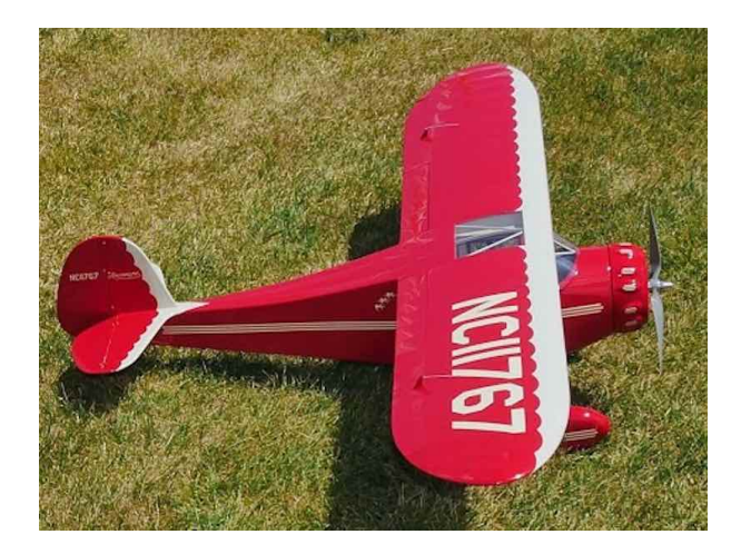
Rick Sawicki photo

https://www.rcgroups.com/forums/showthread.php?2784586