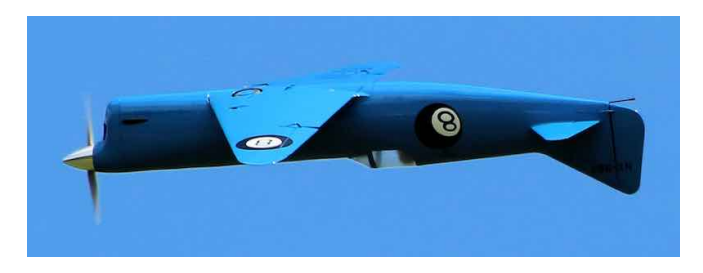
Yes, that is an inverted pass.