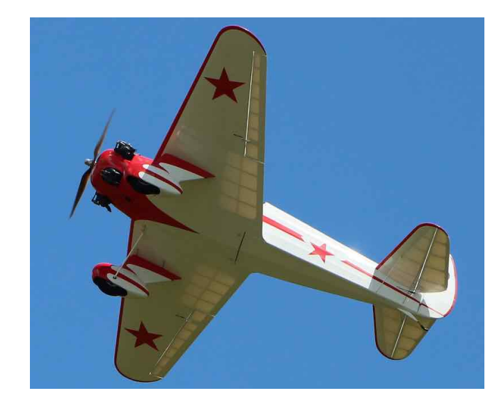
The Yak UT-1 Bottom View