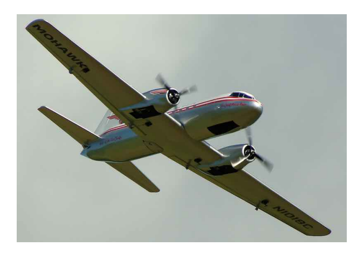
Hong photo Don's Convair on a fly-by with gear up.