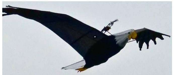
Pete Foss Flew His Giant Eagle

There were a lot of flying of different types of aircraft during the day.