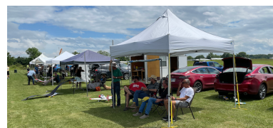
Lots of folks enjoyed sitting around, talking planes and life and just relaxing.