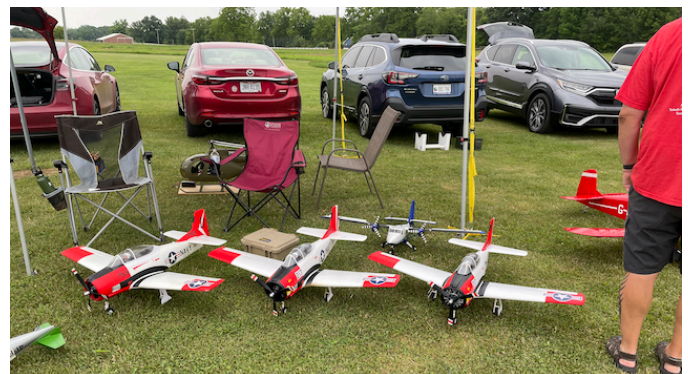
We were also treated to a flight of 3, count 'em, T-28s.