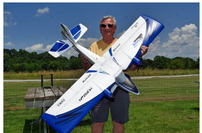
Rick Sawicki, our GREAT Photographer