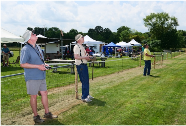
Flying the High Pressure Foam Flurry Event