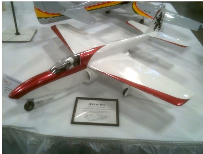
Photo of Award Winning AkroJet at the Toledo Show