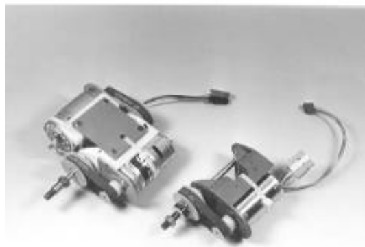
Single and Dual drive units.