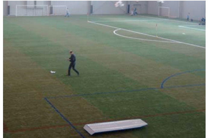
The Stealth Carrier

The second plane that Joe let me fly was a neat little yellow foam Eindecker with a geared brushed motor and Li-Poly batteries. It was a pleasure to fly, and flew quite nicely. Unfortunately, someone put an aircraft carrier in the way when I wasn't looking and I found it on landing, and the abrupt stop at the end of the carrier knocked the motor out. Okay, so the carrier was there the whole time, but it makes a better story, at least from my point of view, to say they put it out after I took off.