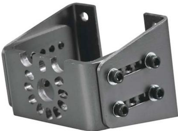
This is the Small