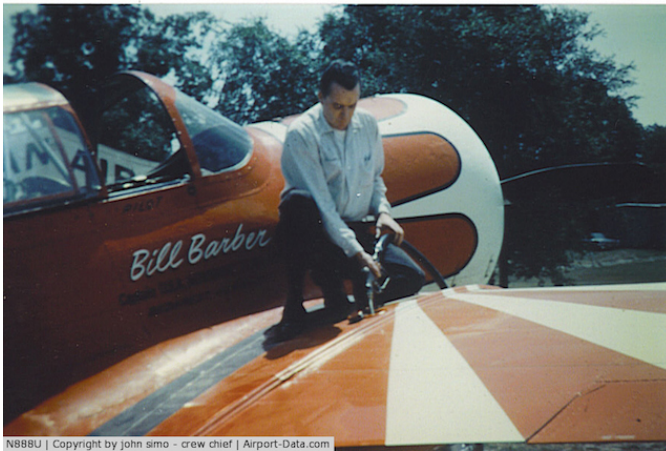
N888U