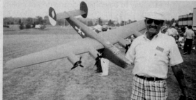
Woody Blanchard with his nice looking B-24 powered by four Astro 035 motors. Note the scale like three bladed props.