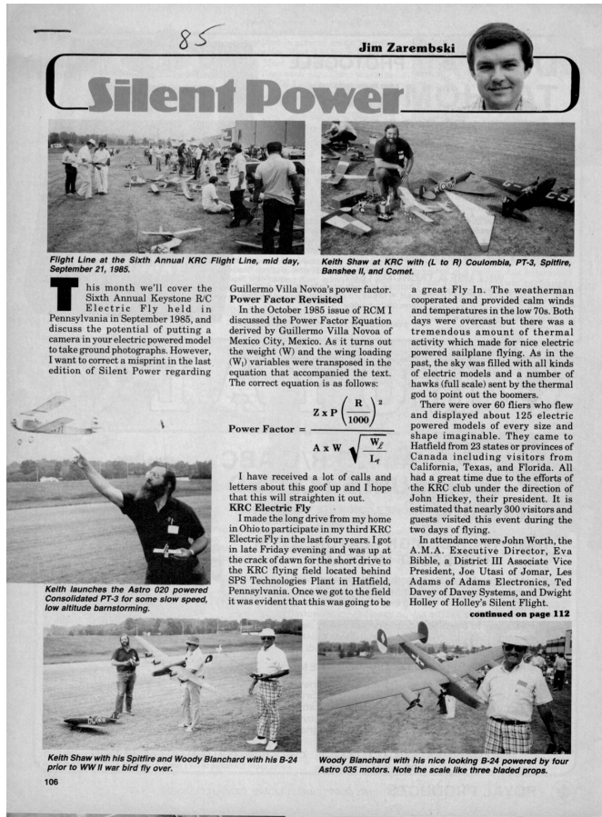
Flight Line at the Sixth Annual KRC Flight Line, mid day, September 21, 1985.