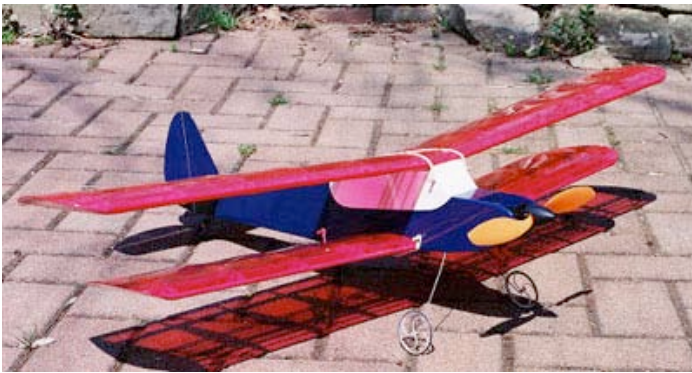
Tom's SR Batteries Bantam Biplane