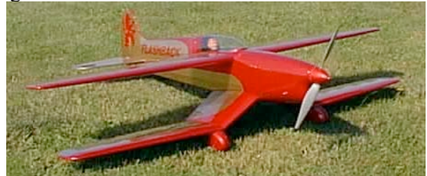
Flashback with updated power system

With approximately 700 sq.in. of wing area and a 52-inch span, the ready to fly weight is now about 3.5 pounds. That is almost a 2-pound reduction in weight. It is an excellent flier in Keith's hands and has turned into the plane he really wanted when he designed it.