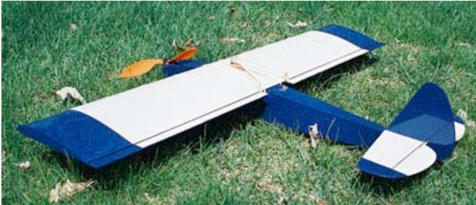
Tom's aileron modified SR Bantam Monoplane