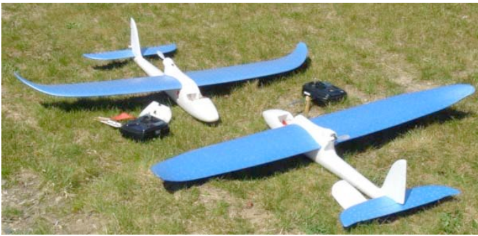
An Easy Star Face Off