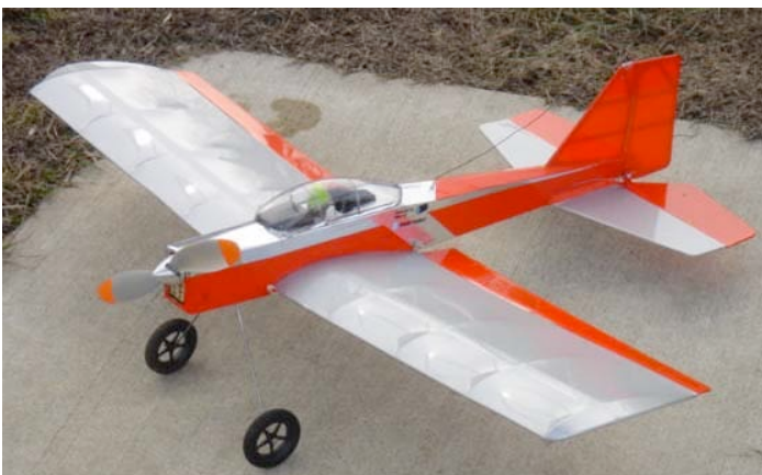
Jim's Mountain Models Switchback Great Flying Plane