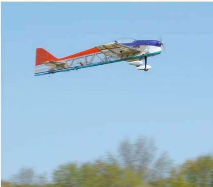
An E3D Type on a fly-by