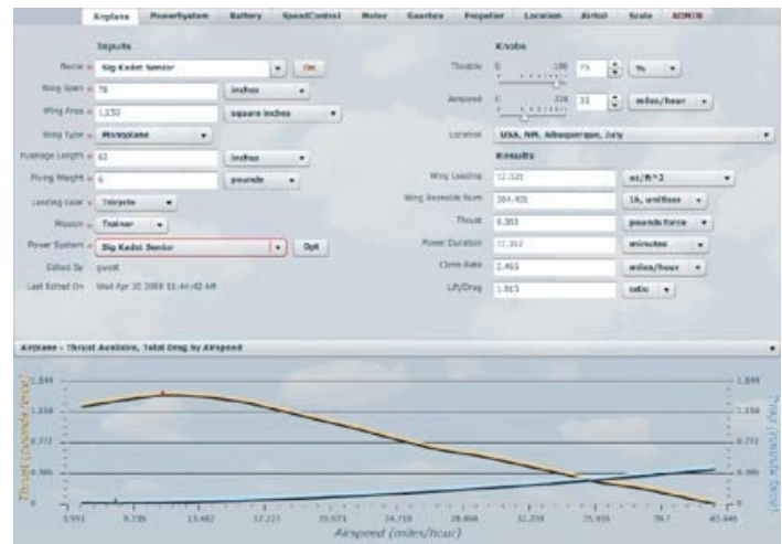
Entry Screen and Chart