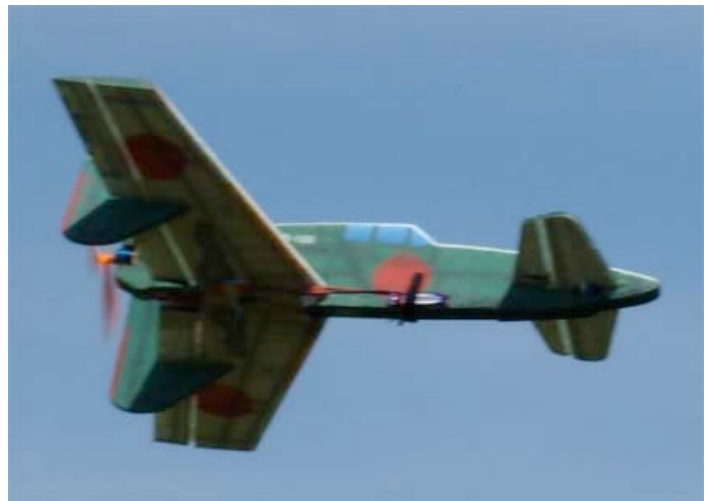
Rick Sawicki's Japanese Profile Canard