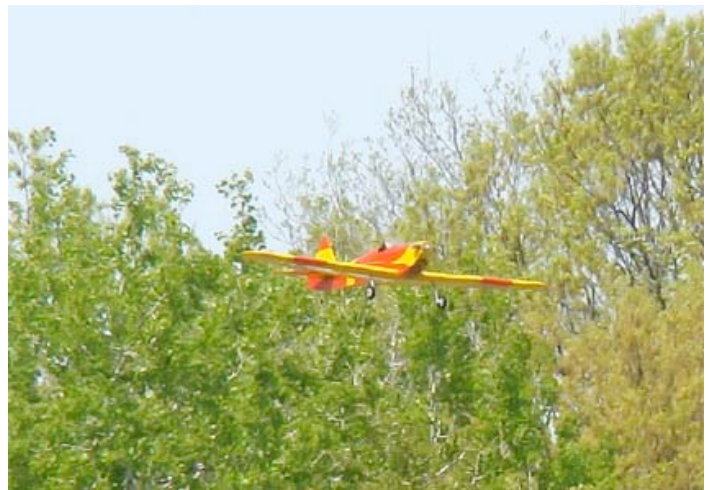
Ken Myers' Son of Swallow Mk II on a Fly-by