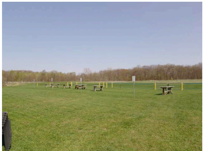
Partial Flight Line Shot

Here are a few more photos of the Midwest RC Society 7 Mile Rd. Flying Field taken a few weeks before the flying meeting.