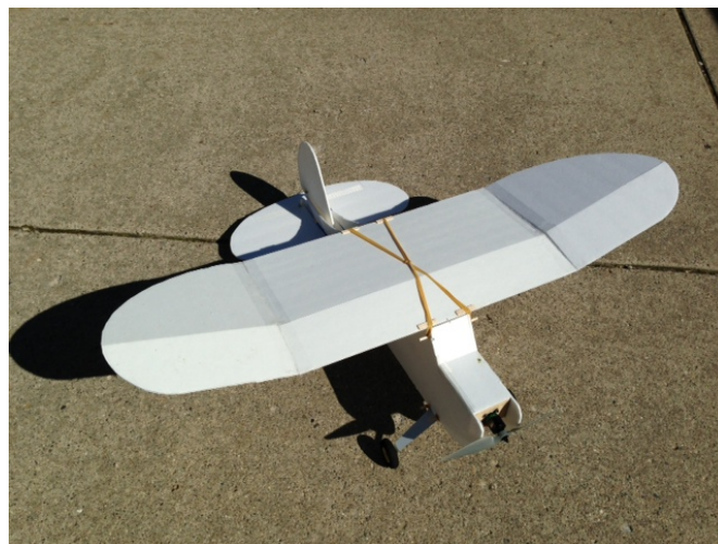
An Old Fogey's Old Fogey Details in this issue

July 11 & 12, 32nd Annual Mid-America Electric Flies - full details in this issue.