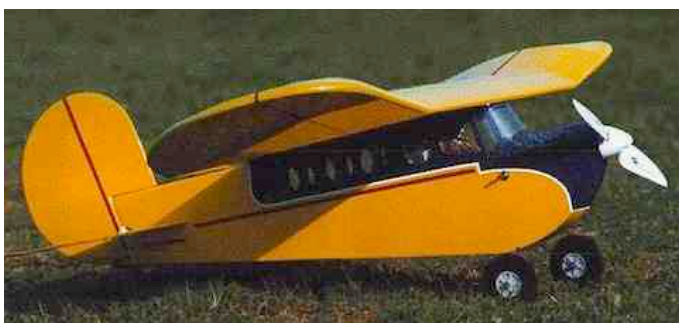
Clancy Lazy Bee