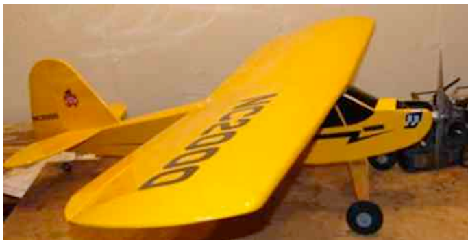
Thunder Tiger Lazy Tiger Cub

The Flite Test (FT) Old Fogey also has a lot in common, including the very short tail moment, with the Thunder Tiger Lazy Tiger Cub and Dereck Woodward's VSP (Very Short Plane).