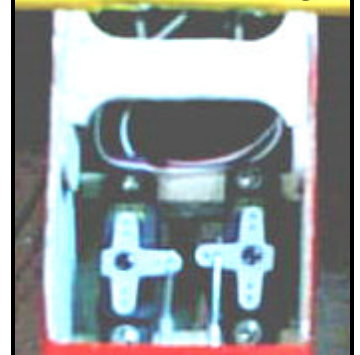
Bottom view aft of wing.

The plane was finished on the eighth day. That was the day I installed all of the radio components and