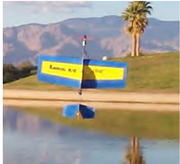
Radical Edge 540 Torque Rolling over Water!

facilities to post a picture which would make the mods so much clearer.