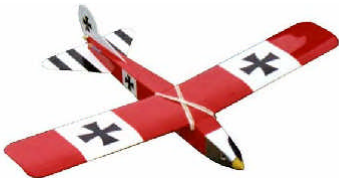
Photo of Fenix 400 from: http://www.komtek.no/fly/S_Models_mainpage.htm