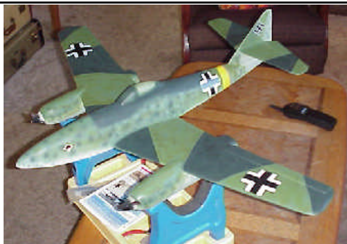
Keep up the good work.....it's cold, and time to get back to the building table. Greg

Enough ranting from my part, I hope everything is well on your side.