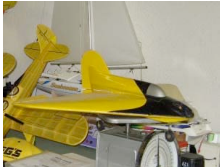
A better photo of the wingy-thingy