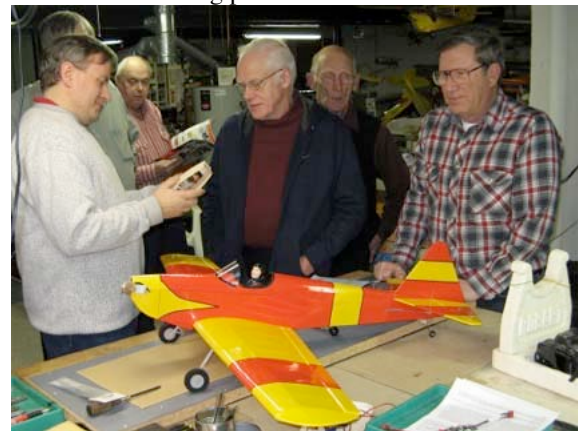
Checking out the nacelle and retracts

Unfortunately, we didn't come up with any possible working solution for him, but we did admire the retracts! They will be a very nice addition to this model and make getting it into the air a bit easier and safer.