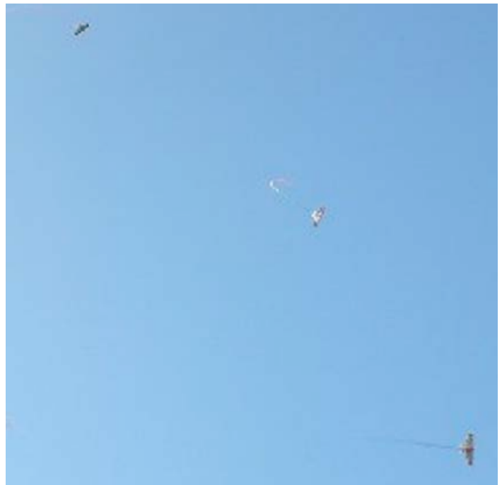
Three of the planes caught in action (top) & five (below)