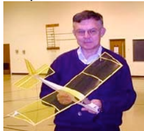
Woody flies in small gyms with the Hitec Feather receiver, 7 cell 50 mAh flight pack, or 3 CR2 Lithiums and 2 HS 55 servos.

A 30" balsa indoor model designed for the Potensky 01, 02 the Dymond 10 or the MTM Hummingbird motors. RTF Weight 4.7 ounces. Revolutionary wing construction techniques using a jig and carbon fiber reinforcement. Uses a 2 cell 880 Lithium Poly pack plan $9.00, parts $17.50, plan $9.00