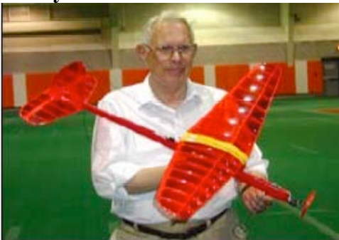
Firefly ROG for Motors up to Speed 280 size, 48-inch wingspan, NACA 6409 Undercambered airfoil

A 46" replica of the Comet Firefly ROG model with 295 sq inches of wing area using the 6409 airfoil. RTF weight 7.5 ounces. For MTM Hummingbird up