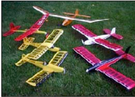
Clockwise from left lower corner: Hummingbird, Mini Rebel, Phantom Flash, Dynamo 400, Jr. Falcon 400, Jr. Skylark 400