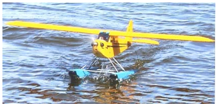
Cub on takeoff run

Best wishes from the Cape, and hope to see you at the NEAT Meet, Rich Flinchbaugh