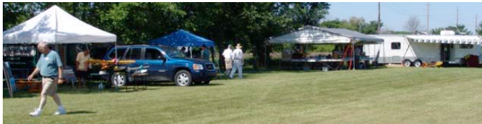
Part of Vendor Row, 2005

Each year we have some excellent vendors attend the meet, as well as some die-hard sponsors. We appreciate them, and hope that you'll remember them when you need to make that next purchase. Here they are for the entire world to know.