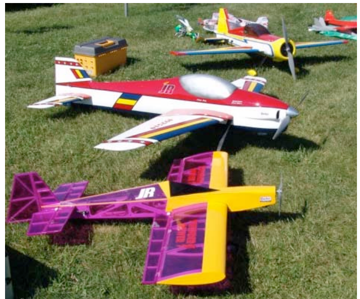
We've Come a Long Way, Baby! Epower now provides excellent performance!