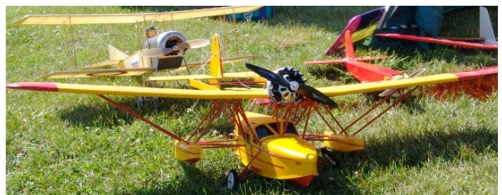
Al Mrock's S-39 with scale biplane in back. Is there a theme here?