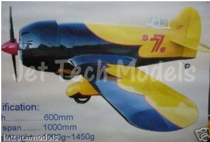
More Info from Web site

The information shown in the Web site graphics match Mark's Known Information. It can also be seen that there is no model designation, other than Gee Bee.