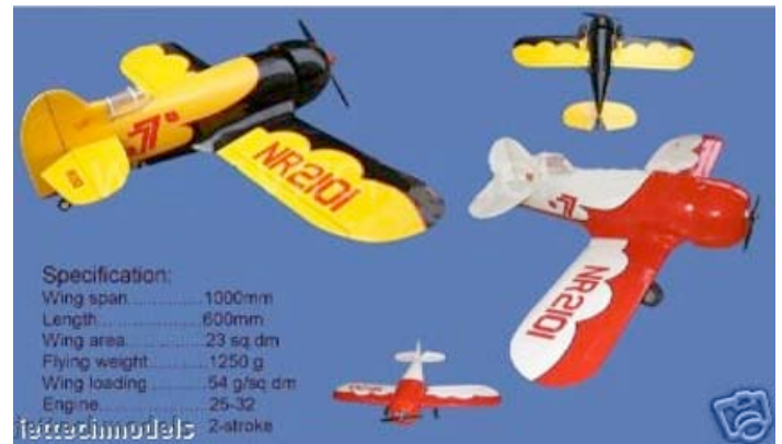
Graphic does not match text from Web site

If you look at the specifications, they do not match Mark's plane, and you can see the person made an error on his Wing Area input as he meant to type 17 sq dm not 17 sq mm. The following graphic from the Web site shows the box.