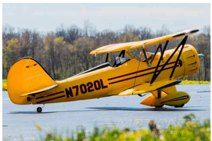
Motion RC photo of Dynam WACO http://www.motionrc.com/dynam-waco-yellow-1270mm-50-wingspan-pnp/