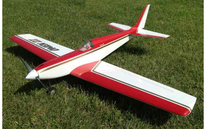
Denny Sumner's, Rittinger designed Omen III Pattern Plane

Denny's version weighs 5 pounds even. The E-flite Power 46 turns a 12x8 prop using a 4S 5300mAh LiPo. It pulls 35 amps, which provides 545 watts in for 109w/lb. He put 6 great flights on it on the first day.