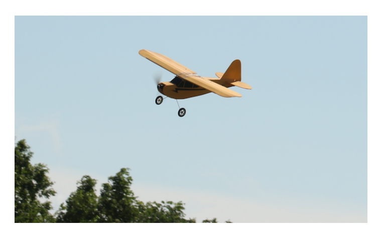
Ken's Cub flying - cub-flying.png Ken probably flew more flights at this years' Mid-Am than any previous year. He flew his modified, version 5, Simple Cub 4-channel with ailerons and if flew amazingly well in the wind.