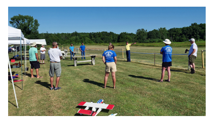
Pilots' Briefing - pilots-meeting 1.png

The 36th Annual Mid-America Electric Flies, AKA the Mid-Am were held on July 11 and 12, 2020 as the COVID-19 pandemic continued in the USA