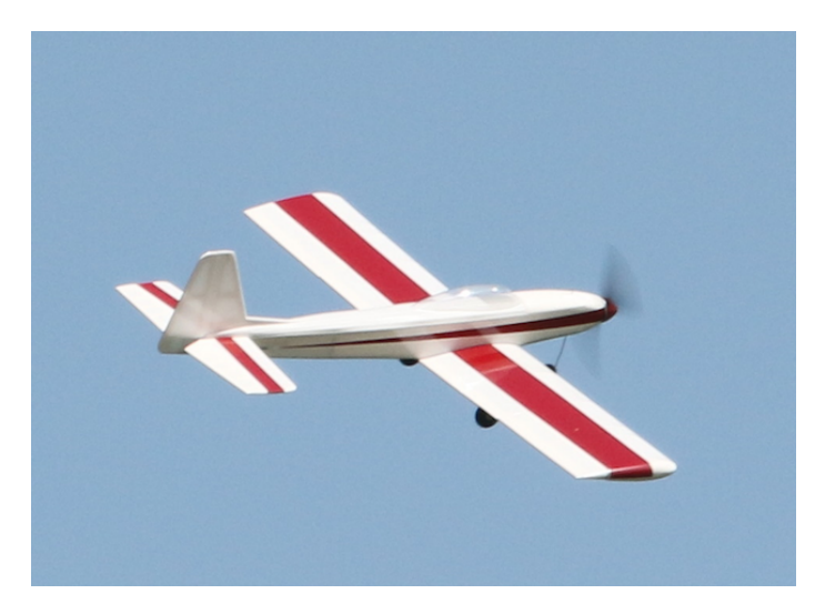
Denny Sumner's Kwik Fli 180 - kwik-fli-180.png