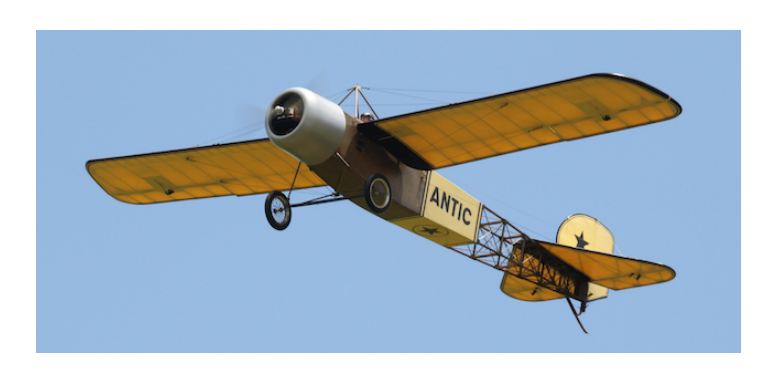
The Antic in the air - antic-flying-cj

Besides his boxes and boxes of mini-electrics, for which he won his a Best Mini Electric Award, he