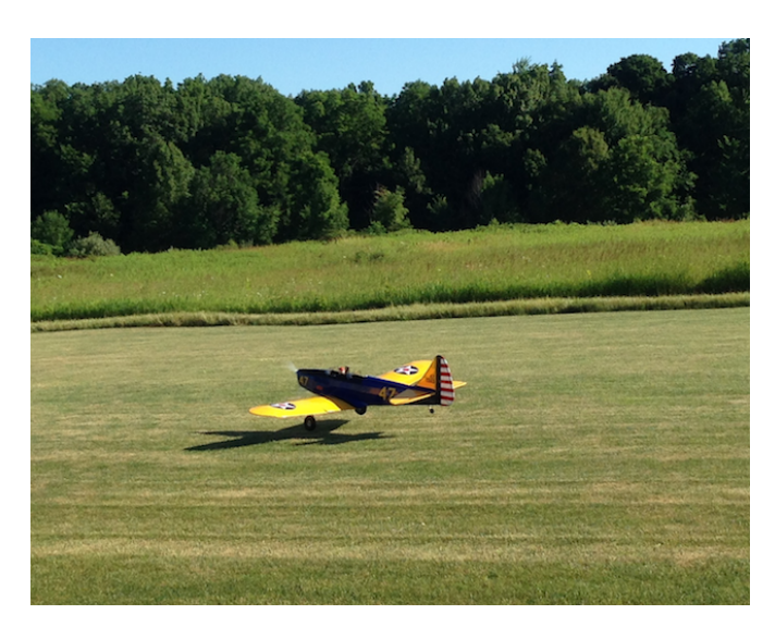
Don's PT-19 lifts off on Saturday morning - belforttakeoff1.png