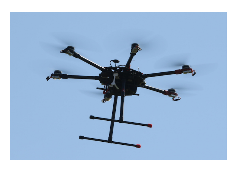
Large Multi-Rotar

https://www.rcgroups.com/forums/showpost.php? p=45145521&postcount=174