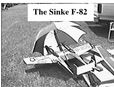
The Sinke F-82