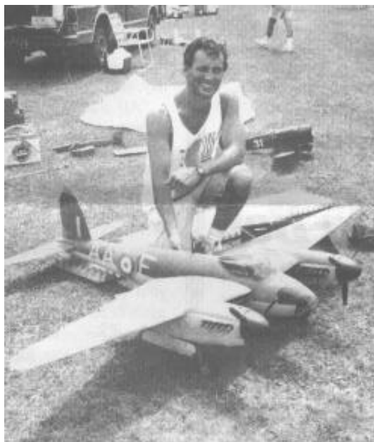
This is the Grife below picture referred to in the article. It gives a good indication as to the size of his Mosquito.