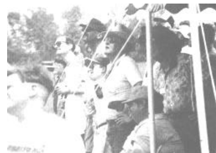
Spectators and Pilots at the 10th Annual Mid-America Electric Flies on July 15 & 16, 1995