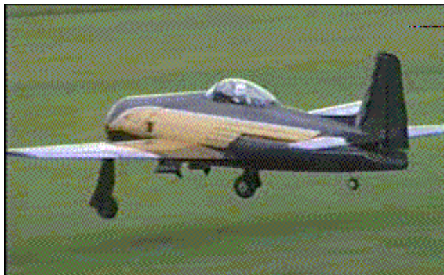
The wheels leave the ground for the very first time in this picture. What a delight.