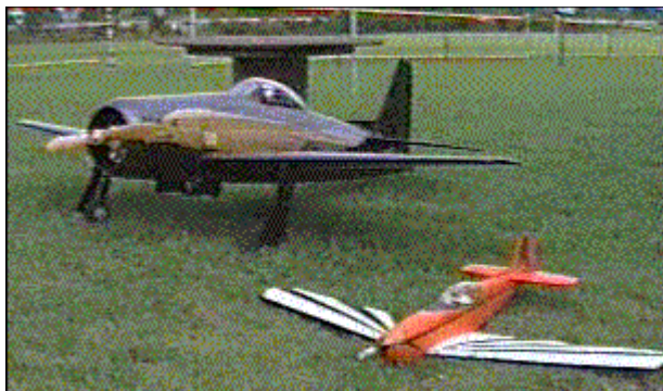
The Bearcat and the Zlin on September 15, 1996