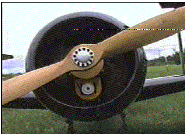
The Business End! The AF FAI 60 mated with the ModelAir-Tech Belt drive provides power to the 22x16 prop. Note the "cool" prop hub Keith made!