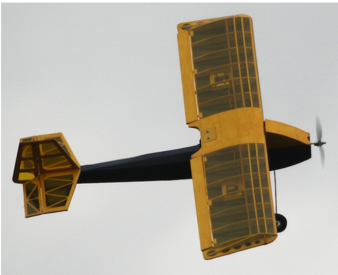
This one cannot weigh much!