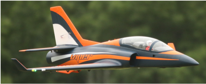
A Low Flying jet!