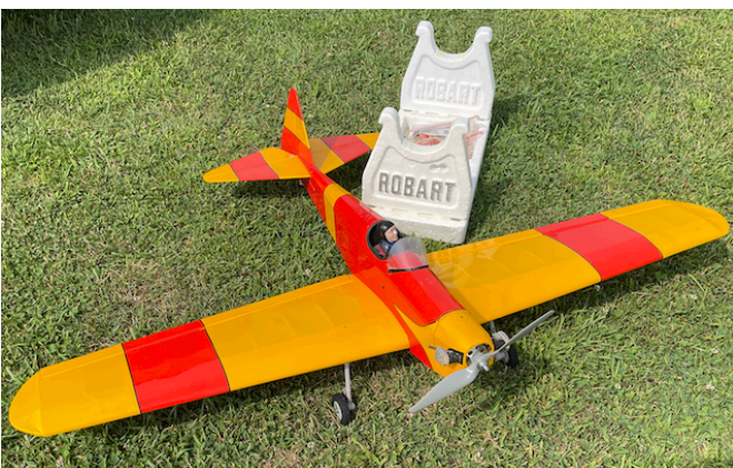
Ken's Son of Swallow Was Out for Its First Outing in over 5 years - It flew Great!!!