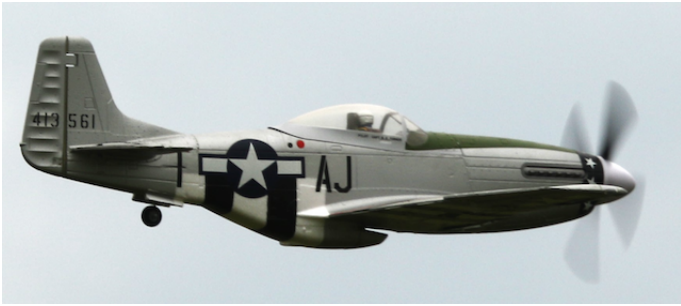
P-51 on a fly by