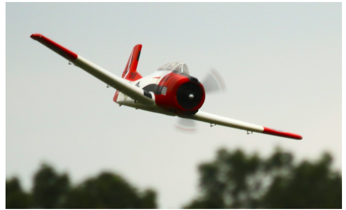
There were three of these at the Mid-Am

http://theampeer.org/ampeer/ampaug23/ampaug23.htm