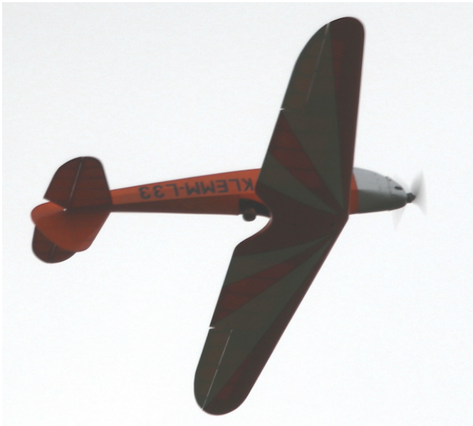
The Klemm inverted