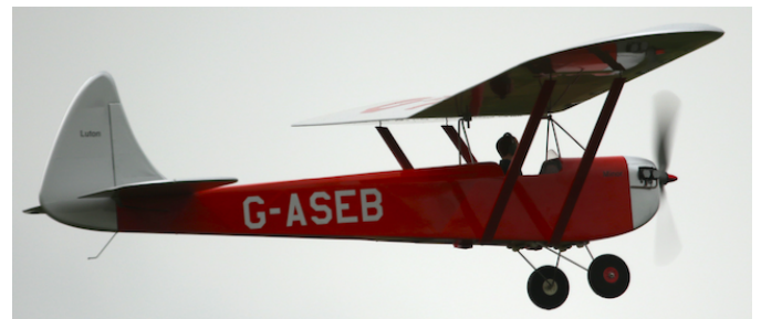
The Luton on a fly by