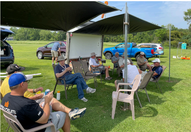
Thanks Greg for Providing Such a Beautiful Day and Great Food!