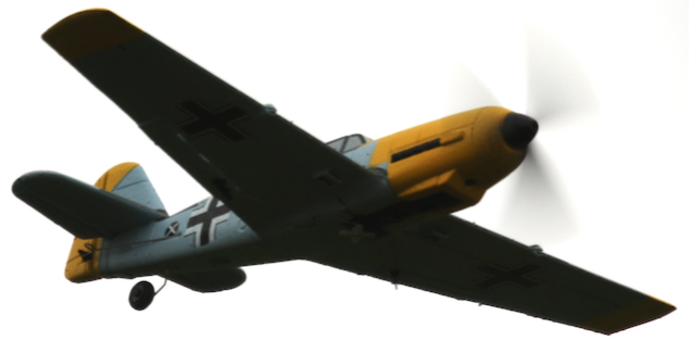
A little ME-109 on a fly by Thanks for sharing with us CJ!